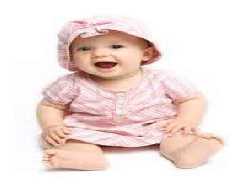
SUMMARY, RECOMMENDATION AND CONCLUSION